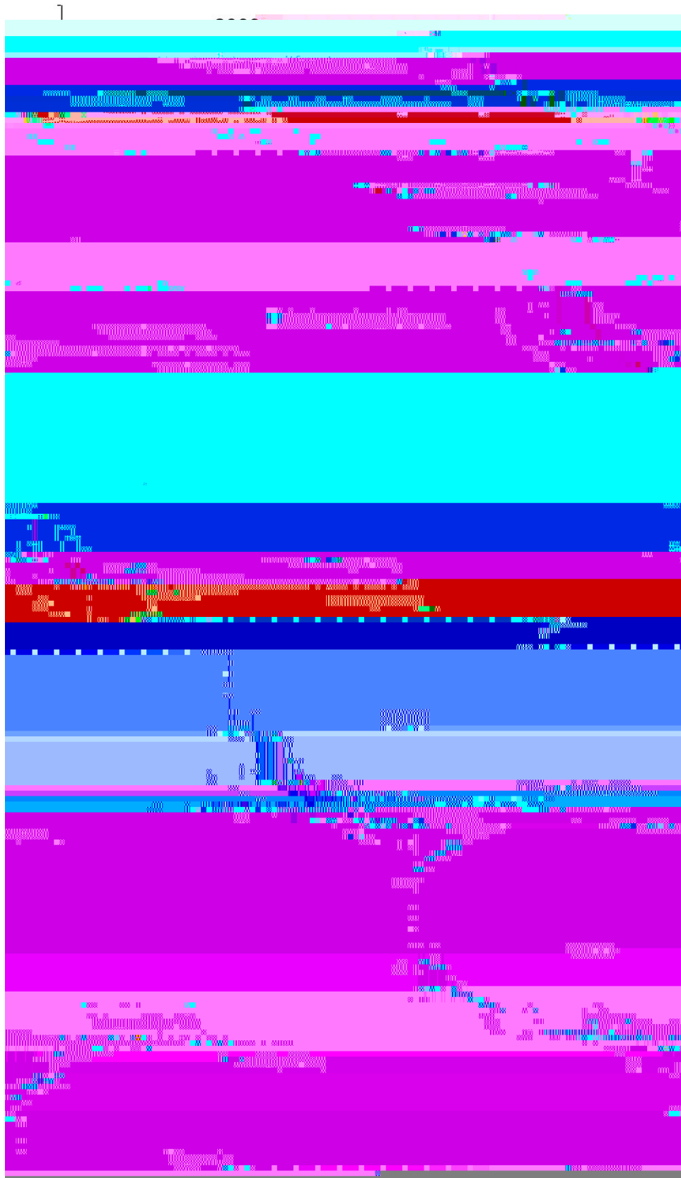
Fig. 2. Rank abundance curves for vegetation in unburned (n = 8) and burned (n = 8) Darlingtonia fens for the years 2003–2007. Bars indicate mean cover found in the eight fens of each type, and error bars indicate \pm 1.0 SEM. Colors indicate individual species and are intended to highlight both temporal changes and differences among fen type for seven dominant species.