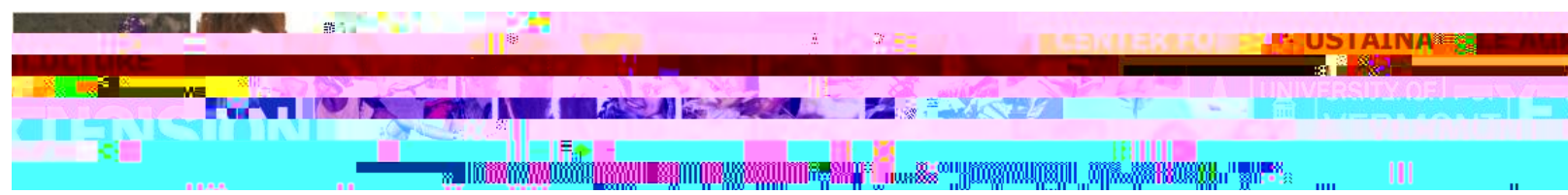
Figure 2. When do you expect to build a BP?

The majority of producers use it for beef, dairy and sheep however, most found benefits by