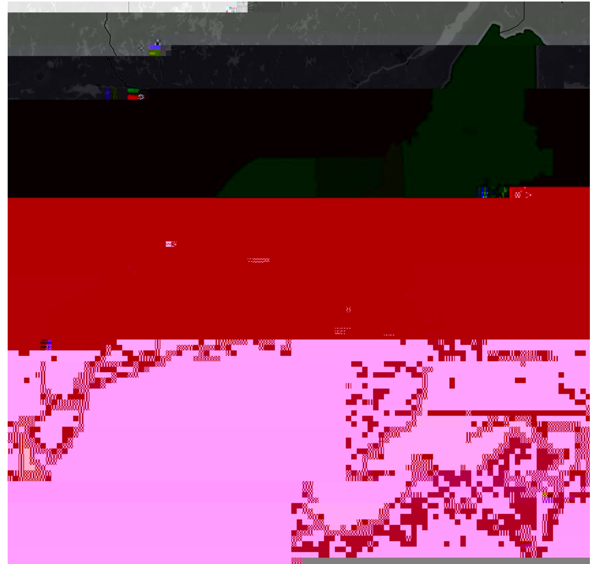
Food processing facilities in the NE by state, MN State Level Food System Indicators Project, 2017