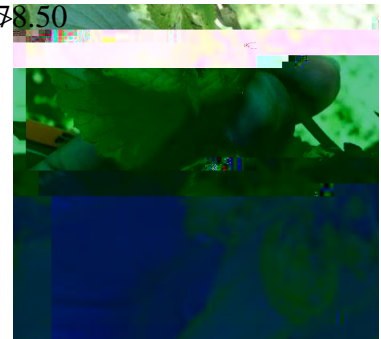
Figure 2. Discoloration on hop cones from downy mildew and/or phoma .

Crowning—the removal of the first flush of hop growth—is used as an early season preventative measure against downy mildew. It is implemented in early spring when it is almost guaranteed that the environment is habitable (cool and wet) for the spread of downy mildew spores. To identify the best timing to crown hop plants, we