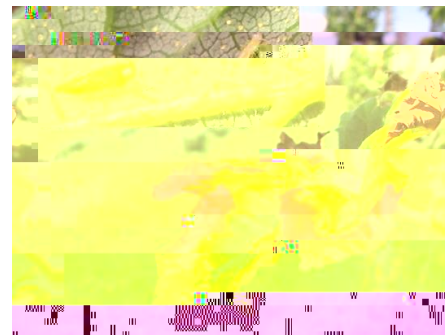
Figure 1. Potato leafhopper damage (hopperburn) and nymphs (inset).

In years with severe leafhopper outbreaks, additional control options may be required. Insecticides are an option especially in years of severe infestation; however, options are limited for certified organic growers. It should be noted that first year plants are far more susceptible to potato leafhopper damage than older, more mature stands of hops. Therefore, insecticide usage should be reserved for more susceptible varieties and younger plants. For organic operations, OMRI-approved products with azadirachtin or pyrethrin as active ingredients are effective against potato leafhopper. For conventional