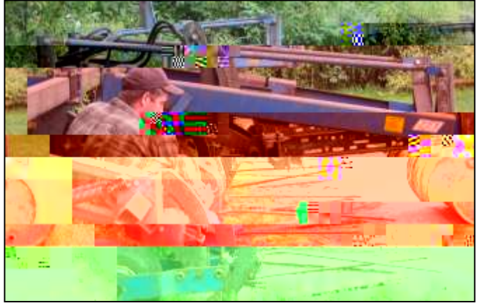
Figure 8. Bean pullers, Morningstar Meadows Farm, Glover, VT.

Because bean pods tend to lie close to the ground, most varieties need to be pulled