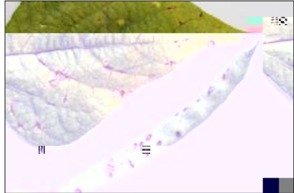
Figure 5. Reddish, dark brown anthracnose in leaf veins and lesions on pod.

planting clean seed, improving air flow and rotating crops.