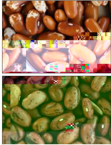
Figure 1. Raquel (top) and Vermont Cranberry (bottom) dry bean varieties.

Dry beans ( Phaseolus spp.) come in a wide variety of shapes, colors, and sizes (Figure 1). Varieties like cattle, European soldier, Black turtle, and Y