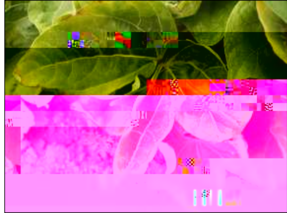
Figure 7. Potato Leafhopper damage “hopper burn”.

Adults land in alfalfa and bean fields upon arrival where they feed and lay eggs. Potato leafhoppers are light green, wedge shaped insects that can be found scuttling on the underside of leaves. Adults are 1/8th of an inch long. Wings do not develop until the adult stage (Figure 6). Depending on spring arrival time and temperature, growers have witnessed 2 to 4 generations per season in the Northeast.