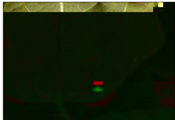
Figure 6. Potato Leafhopper nymph and adult.

Crop rotation is also critical to minimizing diseases present during bean production. Dry beans should not be grown in the same field for more than 3 to 4 years. Small grains are well-suited to rotations with beans because they are not susceptible to the same diseases as beans