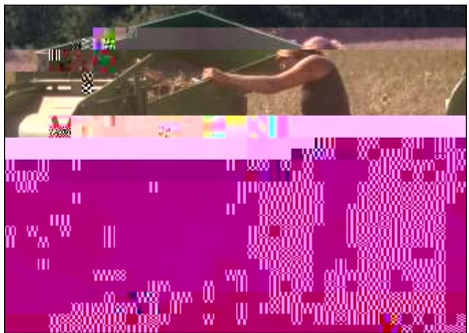
Figure 10. Portable bean thresher, Morningstar Meadows Farm, Glover, VT.