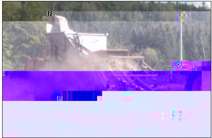
Figure 9. Dry bean combine, Morningstar Meadows Farm, Glover, VT