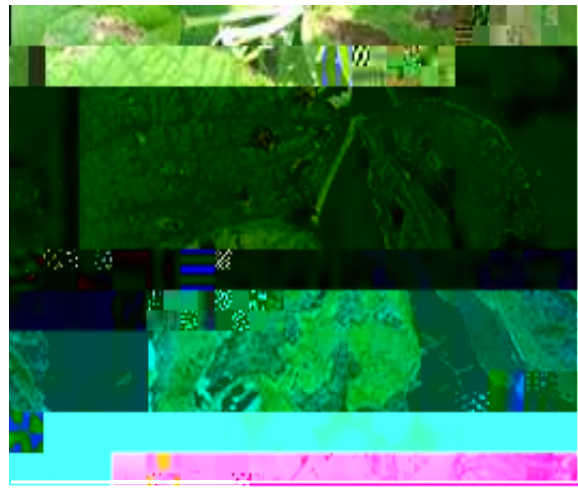
Figure 3. Dry bean plant infected with Bacterial Brown Spot.

Fungal pathogens include Sclerotinia white mold (Figure 4), and one of the most destructive diseases, Anthracnose. Anthracnose (Figure 5) begins with discoloration as red spots on leaves that develops into lesions. As lesions develop, leaf veins turned reddish-dark brown and spread through the leaf. The fungus then spreads to the pods, causing black lesions. Anthracnose can wipe out entire fields of bean and is spread primarily by planting infected seed.