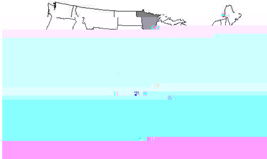
Figure 2: ID Requirements at the Polls

60% of state polling stations do not require the voter to present identification on Election Day but rather operate under the honor system (FEC 1999) (Figure 2). Harsh voter fraud penalties are in place to prevent people from committing such crime. Of those states that do not require identification on Election Day some request a signature from the voter, while 14% of the states have no voter verification requirements at all.